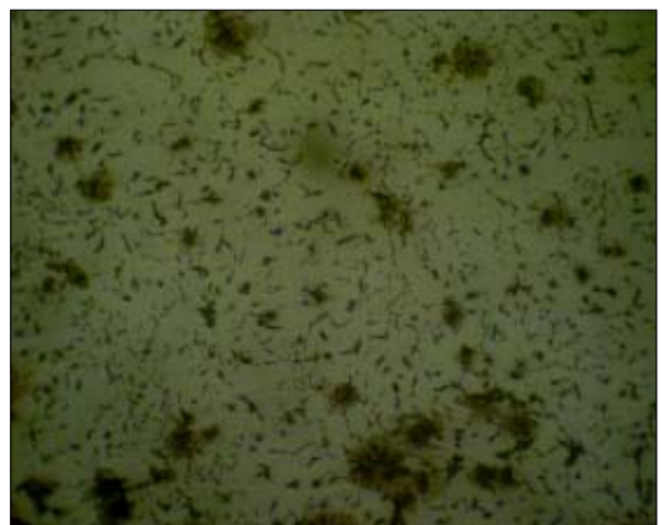
Step - 2