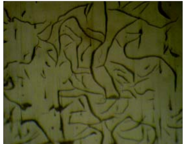
Step - 4