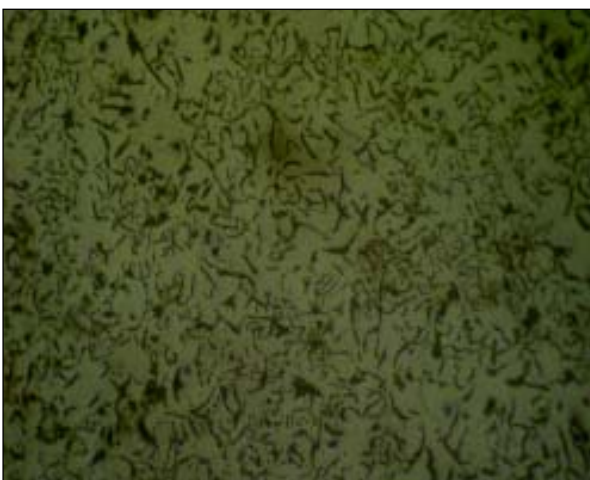
Step - 1