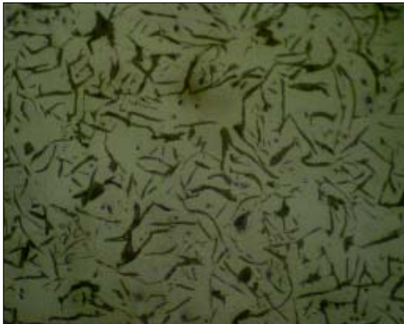
Step - 3