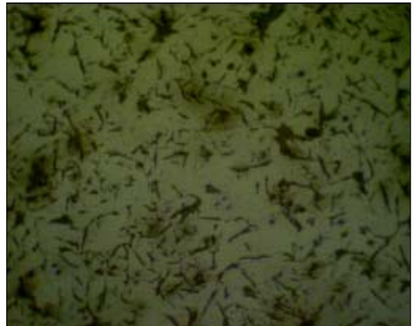
Step - 2