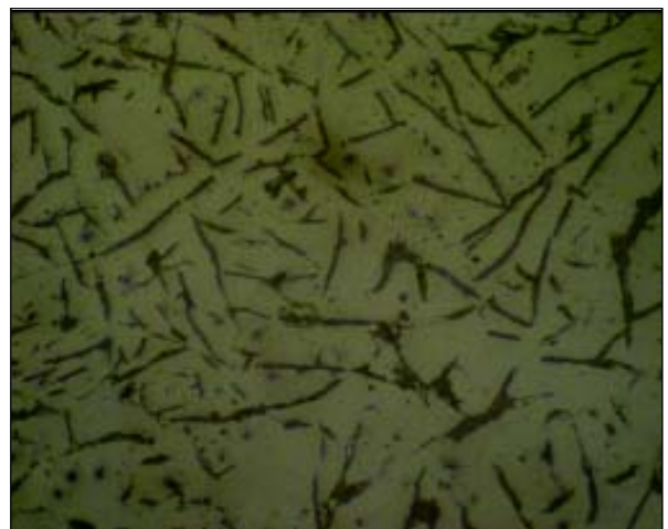
Step - 4