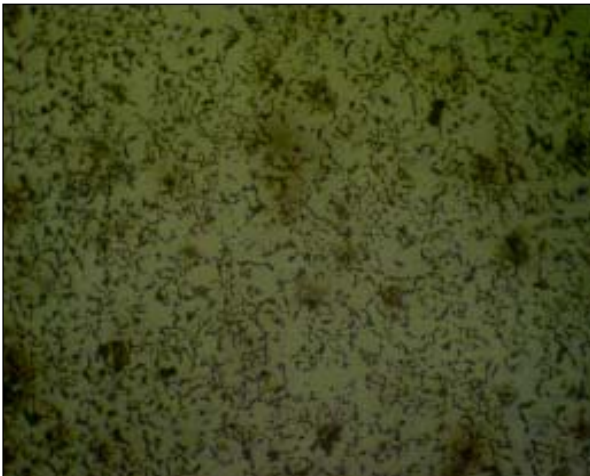
Step - 1